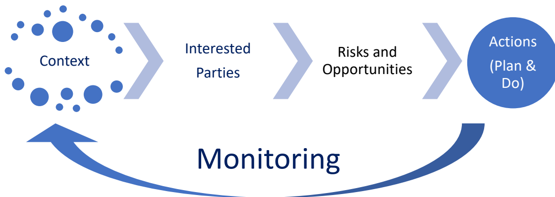
Figure 1 - CIR: Context, Interested Parties, and Risks

The risk-based thinking concept needs little explanation, as it is at the core of the changes introduced in the 2015 edition. The following picture displays an overview of the risk-based thinking while the second identifies main aspects to analyse within the different clauses of the standard.